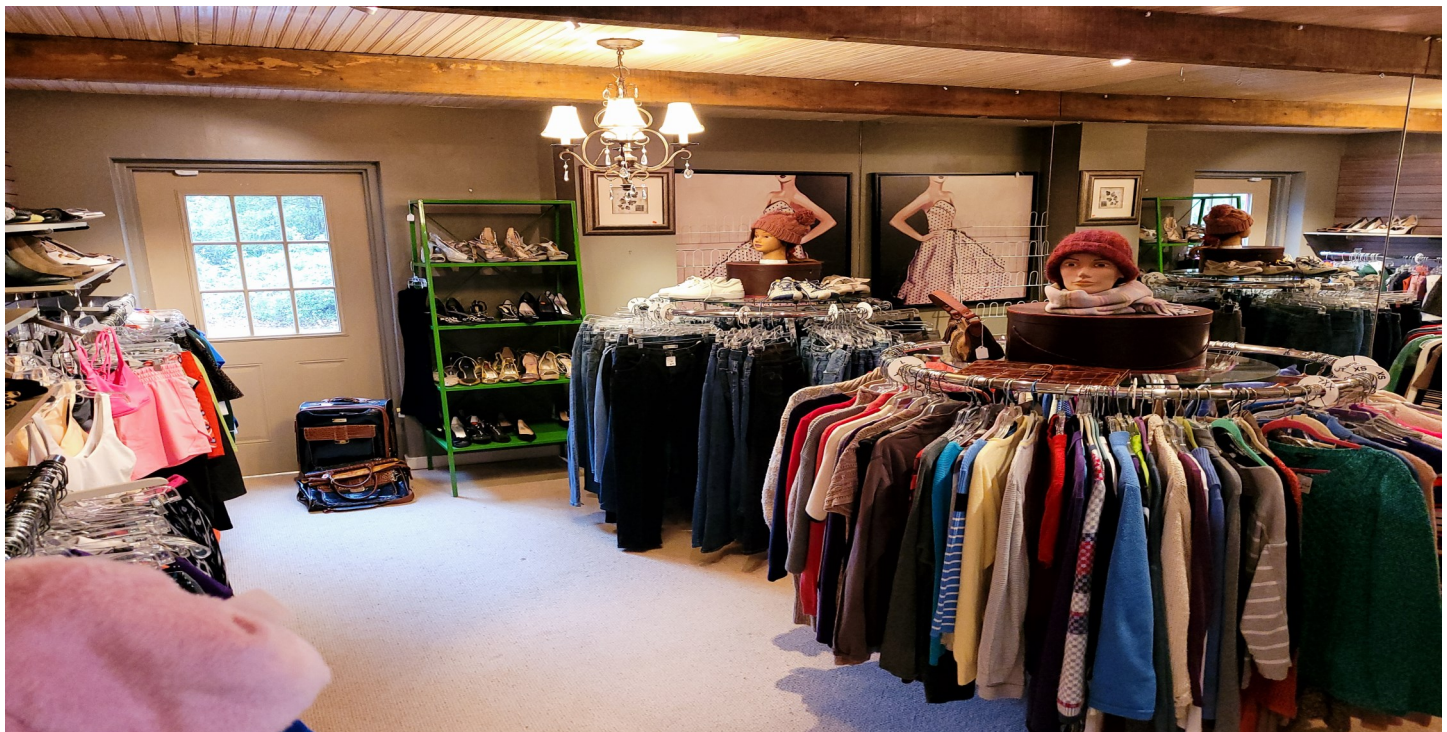
New lighting and new door with window in small boutique room downstairs.