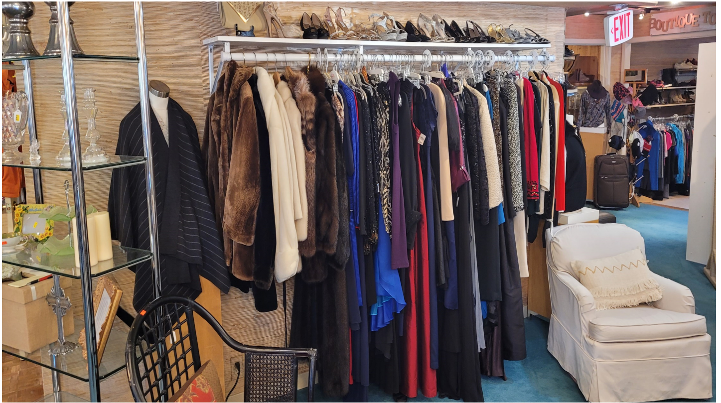
Additional rack added for gowns opposite jewelry counter.