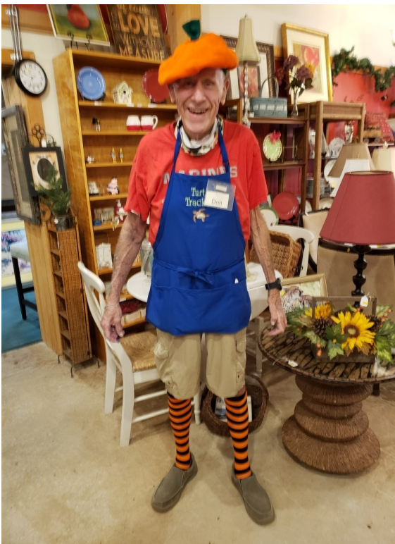
Where is the party!