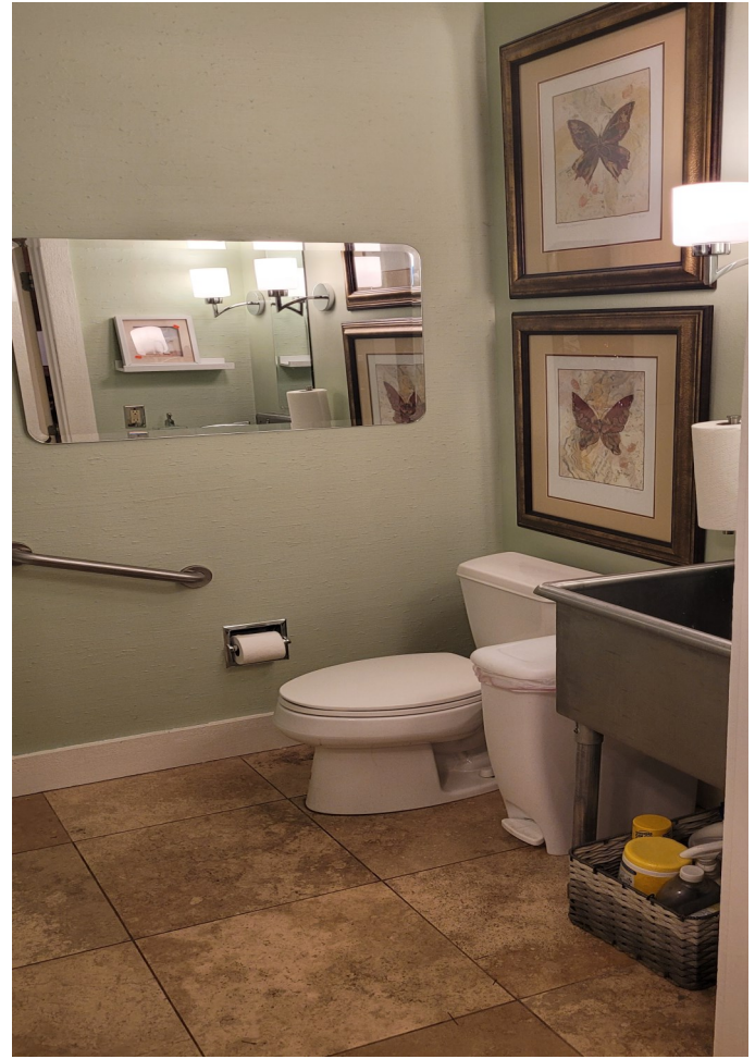
Renovated bathroom downstairs for customers.