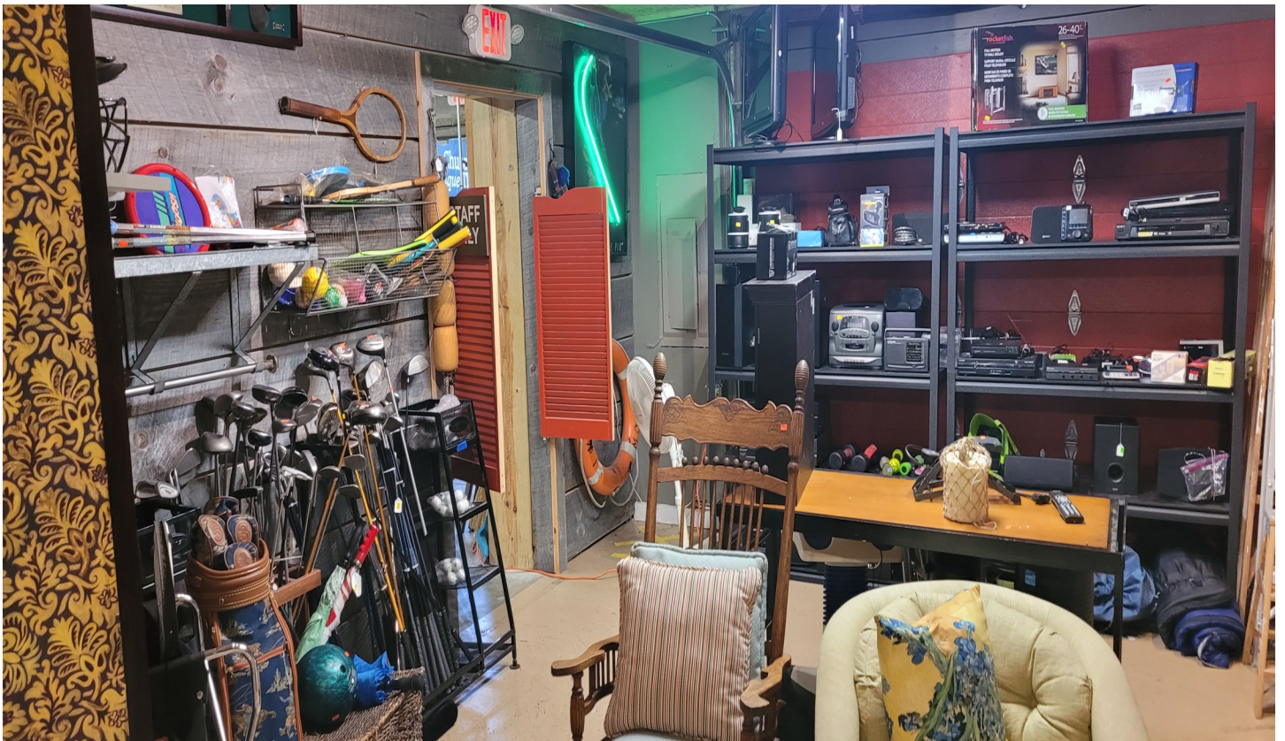
Improved lighting and shelving in the man cave.