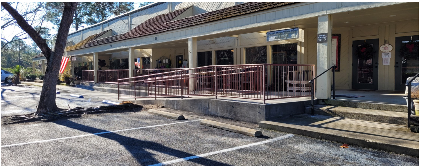
Handicap ramp at front of store.