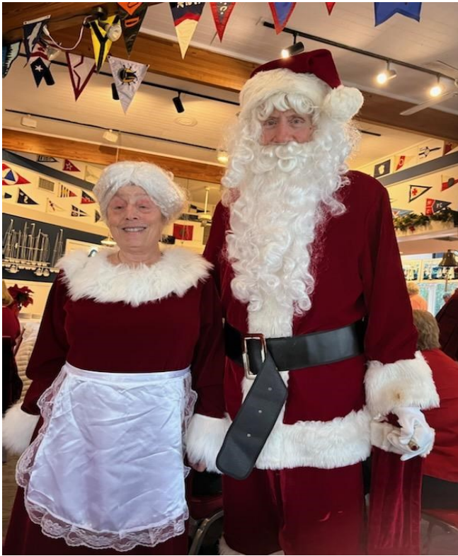
Mr. & Mrs. Claus made an appearance at our Christmas party!