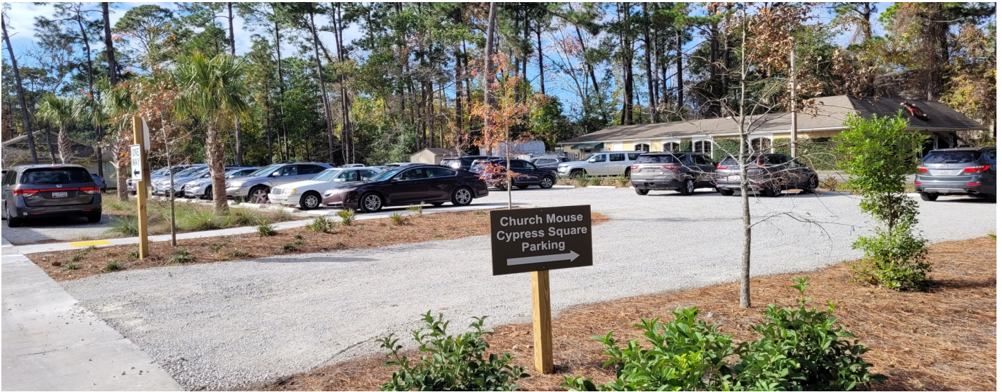
Wooded lot next door transformed into parking lot for 31 cars.