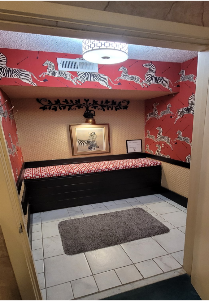
Added new dressing room downstairs.