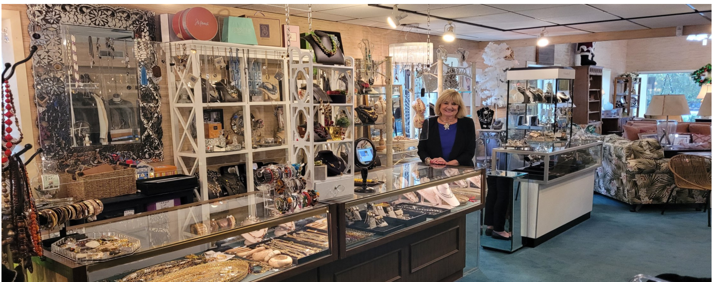
Expanded jewelry department display.