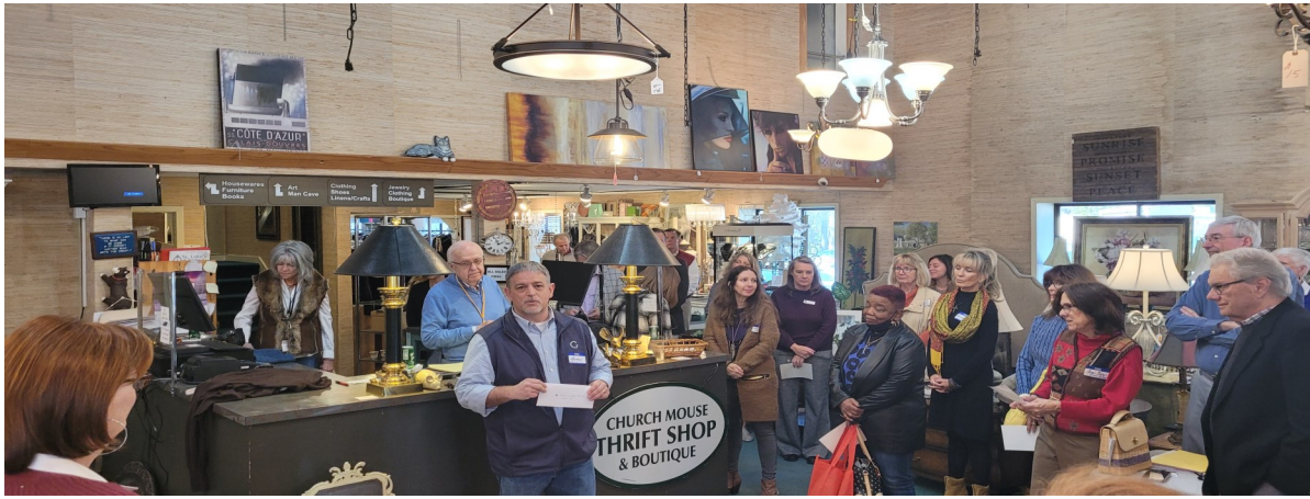
One of the highlights of the year—handing out grant checks to non-profit organizations!