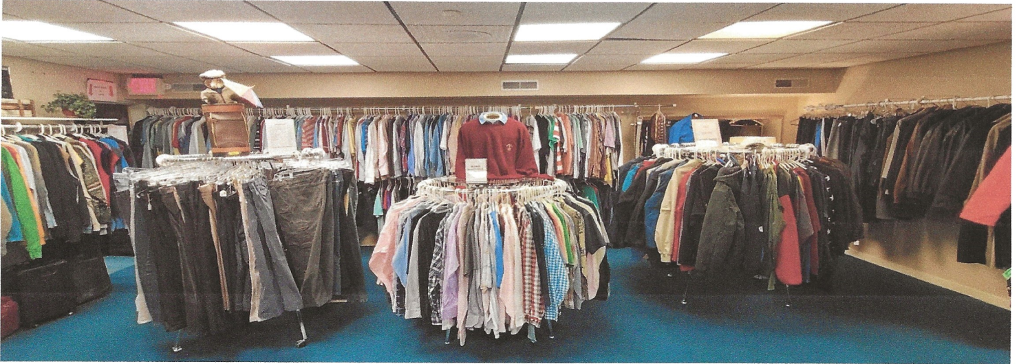
Men's Department Expansion