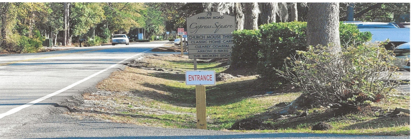
New Entrance / Exit Signage.