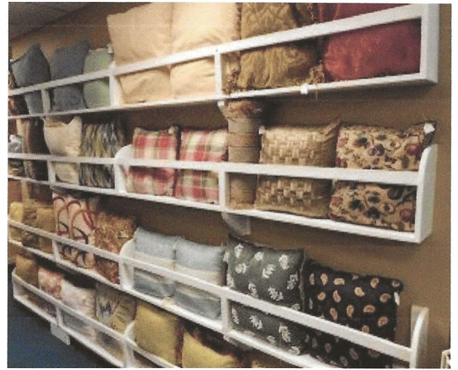
New and improved linen area