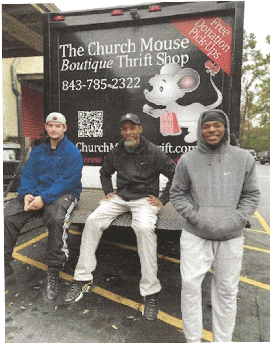
Receiving/delivery Team 2023